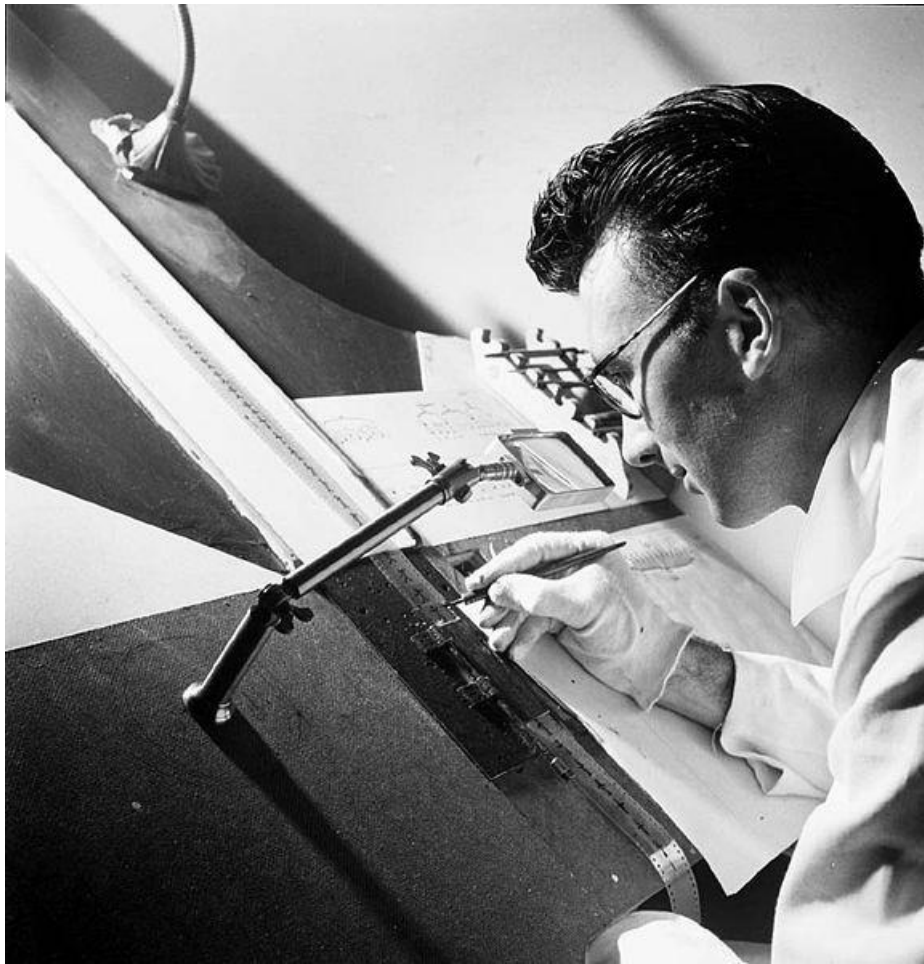
Norman McLaren drawing on film, 1944