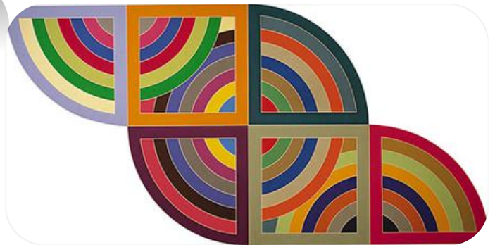
Shoubeegi - Indian Bird

Medium: Polymer and fluorescent polymer paint on canvas