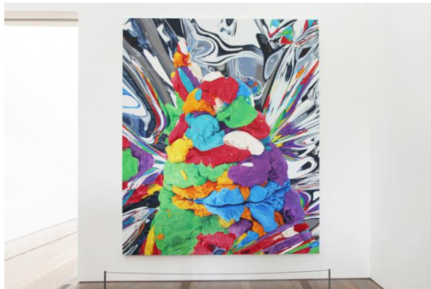
Play-Doh, 1995–2008. Oil on canvas, 131¼x 111¼inches.

After Viewing: Koons speaks about his desire for communication and interaction. How does his choice of media, materials, and subjects relate to his desire to communicate through his work?