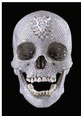
Title: For the Love of God , 2007 Materials: platinum, diamond, human teeth

Concept is the most important aspect of art. Do you agree, reference other artists?