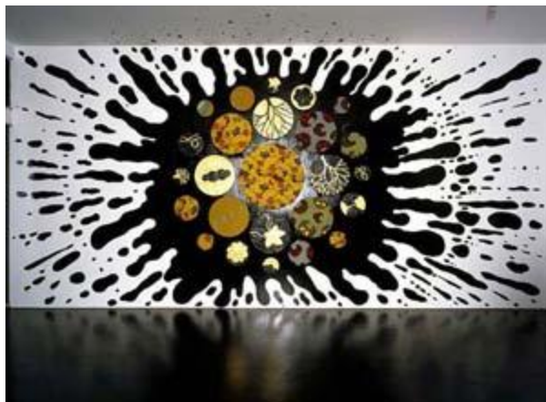
Snake Ceiling – On May 12, 2008, a

In your opinion which of these is the most important when looking at Black Gold? (You may want to consider the subject matter, the material, influences, the viewer's role...)