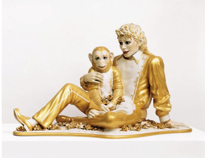
Michael Jackson and Bubbles, 1988. Porcelain, 42x 70½x

PPT-Jeff Koons –includes Ways of Seeing/Learnt assumptions and questions